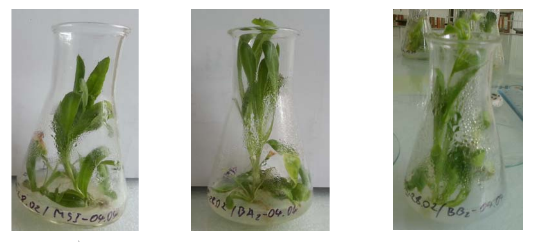
a) b) c) Figure 2 . Samples of Caledula officinalis on different growth medium a) MS, b) BA<sub>2</sub>, c) BB<sub>2</sub>

The highest rate for leaves growth was obtained using BB_2 medium followed by BA_2 medium as can also be observed in Figure 2.