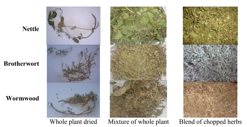
Fig. 1. Aspects of the integer plants before and after chopping.

Aspects with the integer plants before and after chopping is observed in the images of Figure 1.